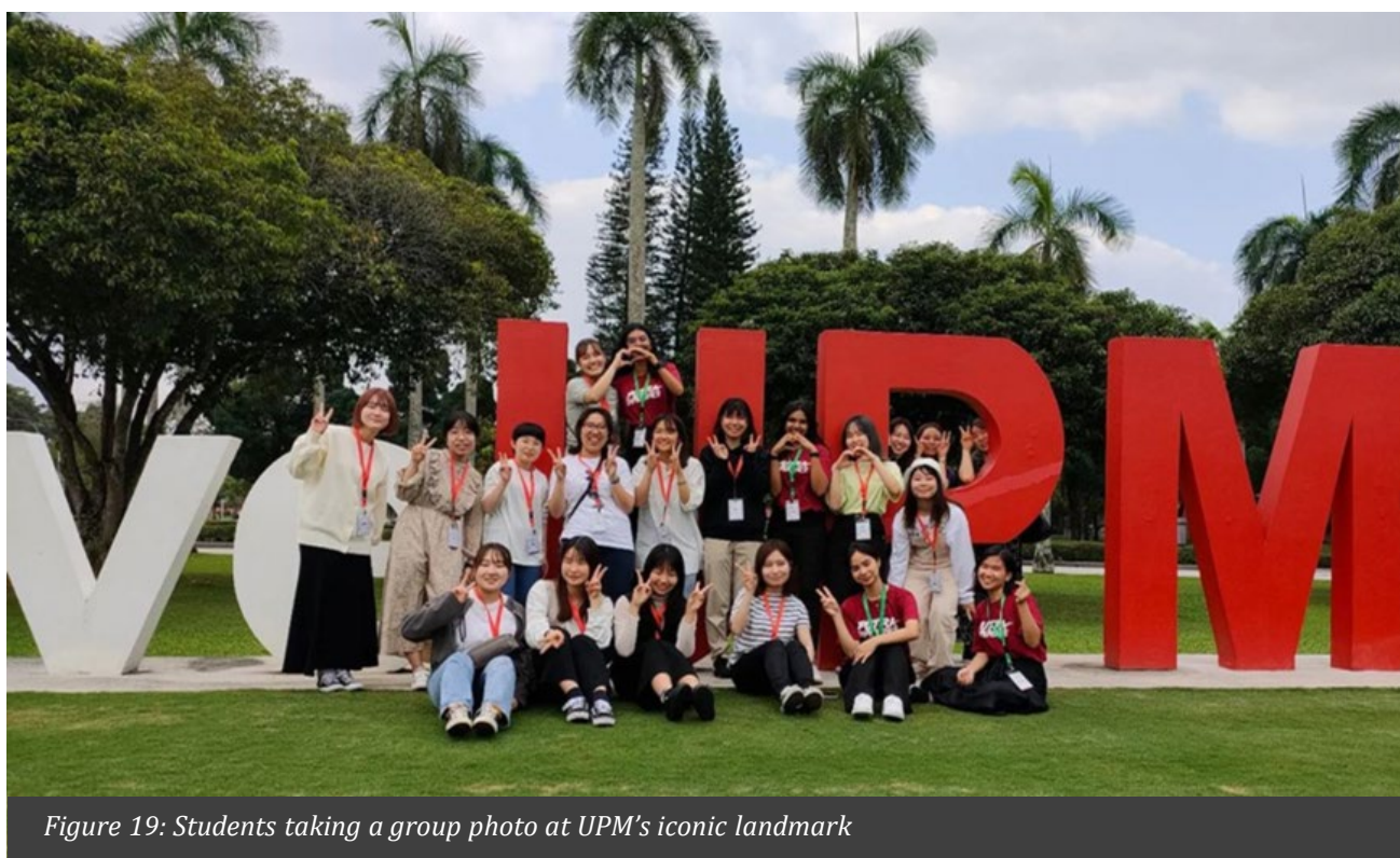
Figure 19: Students taking a group photo at UPM's iconic landmark

“I loved the modules in the program especially at SISFEC because I could learn the difference in vegetation between Japan and Malaysia, I was really happy that the buddies took us to the places we wanted to go and supported us with shopping. I really love the buddies and would love to see them again. Thank you very much for supporting us and making me like Malaysia. I love Malaysia! ”