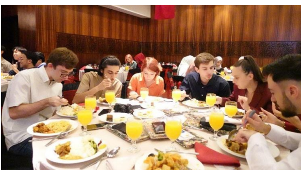
Figure 17: Students enjoyed a Farewell Ceremony Semester 2, 2022/2023, held at Putrajaya

The farewell event held at the picturesque Palm Garden Golf Club, Putrajaya, stood as a testament to the diverse and enriching experiences these students have brought to our campus. Their presence has indeed added cultural vibrancy and fostered a profound understanding of global perspectives among our students and faculty. Students from 11 countries, such as France, South Korea, Germany, Brunei, and Japan, who pursued their inbound mobility program at UPM for the Second Semester of 2022/2023, have undoubtedly provided a rich and multicultural learning experience for everyone involved.