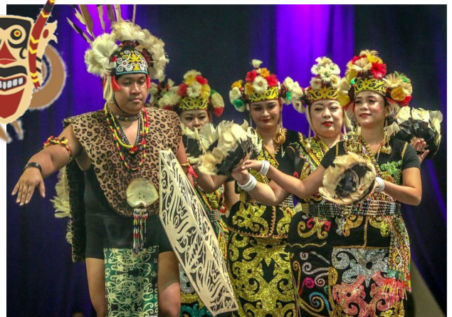
Figure 22: Hari Gawai Celebration in Sarawak