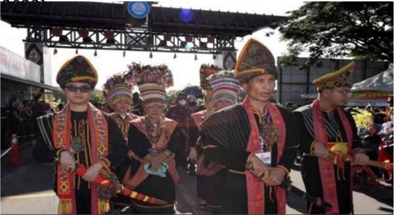
Figure 21: Celebration of the Harvest Festival (Pesta Kaamatan)