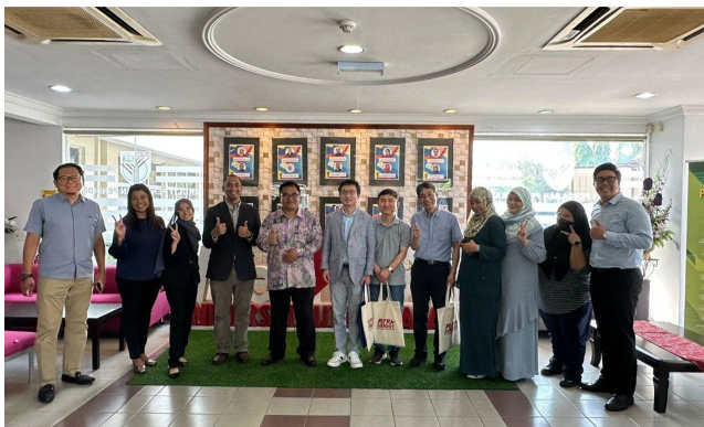
Figure 9: Courtesy Visit from the Delegates from Jeonbuk National University to the Faculty of Educational Studies, coordinated by PUTRA International Centre (i-PUTRA)

The proactive approach of i-PUTRA in coordinating international engagements is a testament to UPM's commitment to fostering global partnerships. By welcoming representatives from a multitude of countries and exploring future collaborations, UPM is positioning itself as a hub for international academic and cultural exchange. With its inclusive approach and ambitious plans for the future, UPM is poised to continue making valuable contributions to the internationalisation of education and research. These efforts not only benefit the university but also pave the way for a brighter, more interconnected future for all.