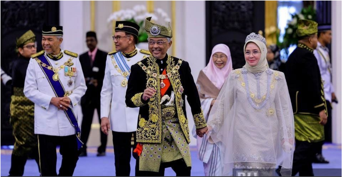
Figure 23: The celebration of the Paduka Baginda Yang di-Pertua Agong Birthday