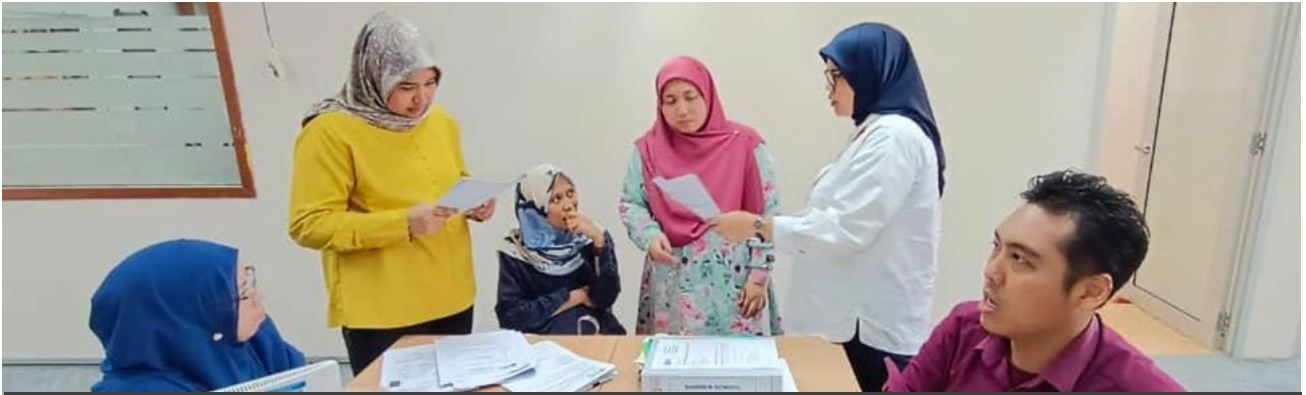
Figure 4 : Discussion for a process that helps to organize proper management of internal audit.

An audit is crucial for every organisation. It helps the organisation have proper controls, governance, and risk management processes. To further reflect on the management and service provided at i-PUTRA, an internal audit was held from 13 to 15 June 2023 to assess the risk and evaluate and improve internal controls at i-PUTRA.