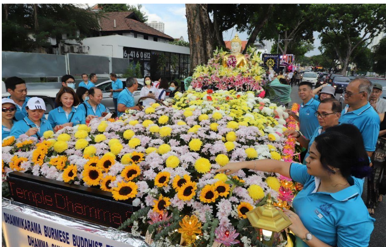
Figure 20: Wesak Day Procession in Penang

Wesak Day, also known as Vesak Day, is a significant Buddhist holiday celebrated in Malaysia, as well as in other Buddhist-majority countries, to commemorate the birth, enlightenment, and death of Siddhartha Gautama, who later became Gautama Buddha. Wesak Day is not only a religious observance but also a time for Buddhists to reflect on the teachings of the Buddha and strive for spiritual growth and enlightenment. It is a day that promotes compassion, harmony, and goodwill among people of all backgrounds in Malaysia.