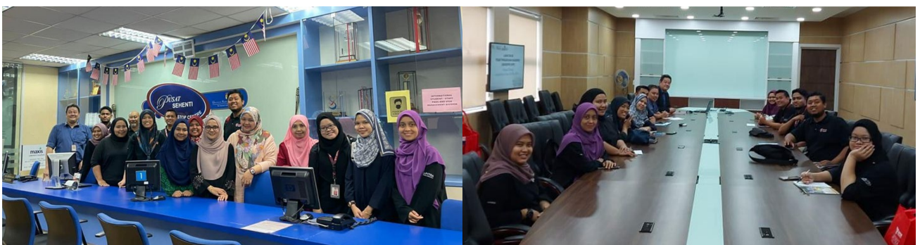
Figure 8: Benchmarking visit to UKM