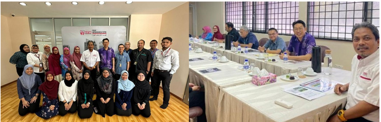
Figure 7: Courtesy Visit from IIUM with UPNM at i-PUTRA, UPM