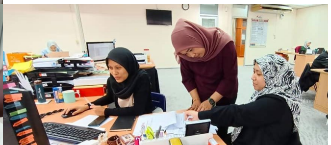
Figure 5: i-PUTRA's staff has an internal auditor who oversees various functions including customer service, etc.