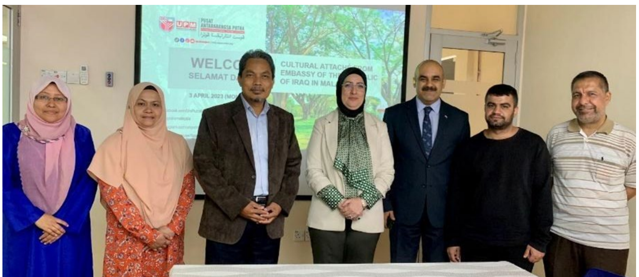
Figure 11: Group photo between the i-PUTRA Representative and the Representative from Cultural Attache from the Embassy of Iraq in Malaysia