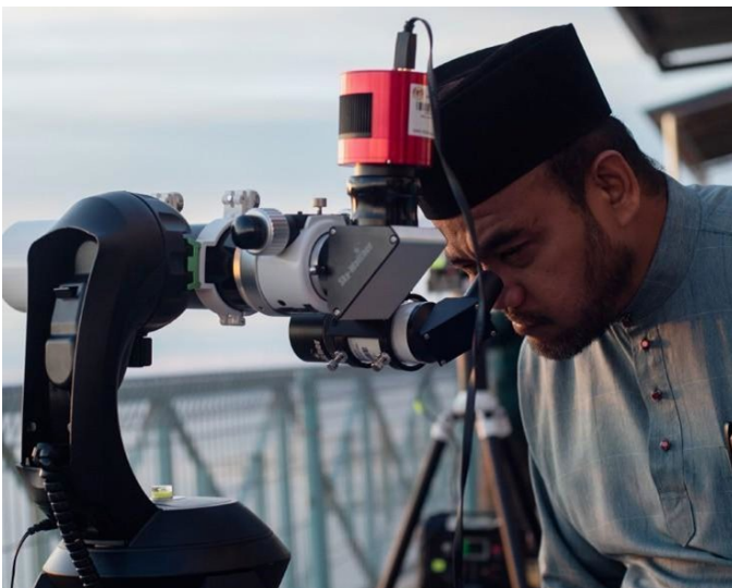
Figure 24: A member of the moon-sighting committee observing the sighting of the new moon which marks the start of the Hijr Lunar Month, Dzulhijjah.

Hari Gawai is a significant cultural and religious festival celebrated by the indigenous communities of Sarawak, one of the two Malaysian states on the island of Borneo. It is primarily observed by the Iban and Bidayuh ethnic groups but is also celebrated by other indigenous communities in Sarawak. Hari Gawai is a harvest celebration and a vital cultural and spiritual event that strengthens the ties between communities, generations, and ancestral spirits. It plays a crucial role in preserving and promoting the cultural heritage of Sarawak’s indigenous peoples.