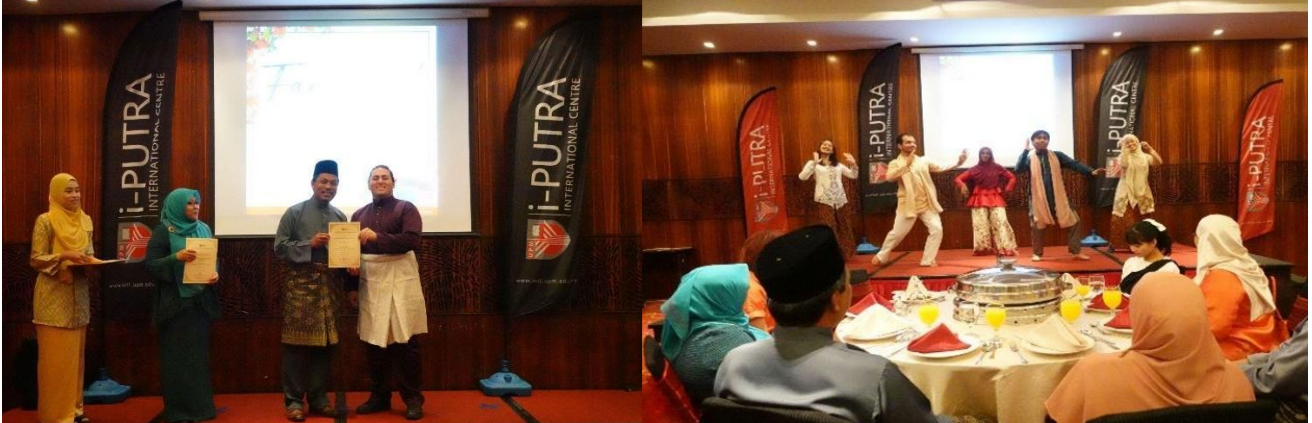
Figure 16: Inbound Semester Exchange Students Farewell Ceremony Semester 2, 2022/2023 at Putrajaya

On this memorable day, the 23 rd of June 2023, we gather to bid a warm and heartfelt farewell to our cherished mobility students who have played an integral role in our inbound exchange semester program. As they embark on their journey back to their home countries, we celebrate their invaluable time with us and express our deepest gratitude.