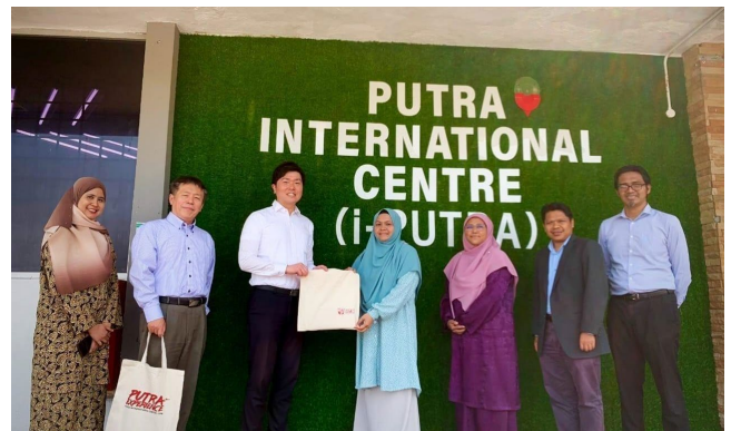
Figure 10: Gift Exchange session between the UPM representative and the Soka University Representatives