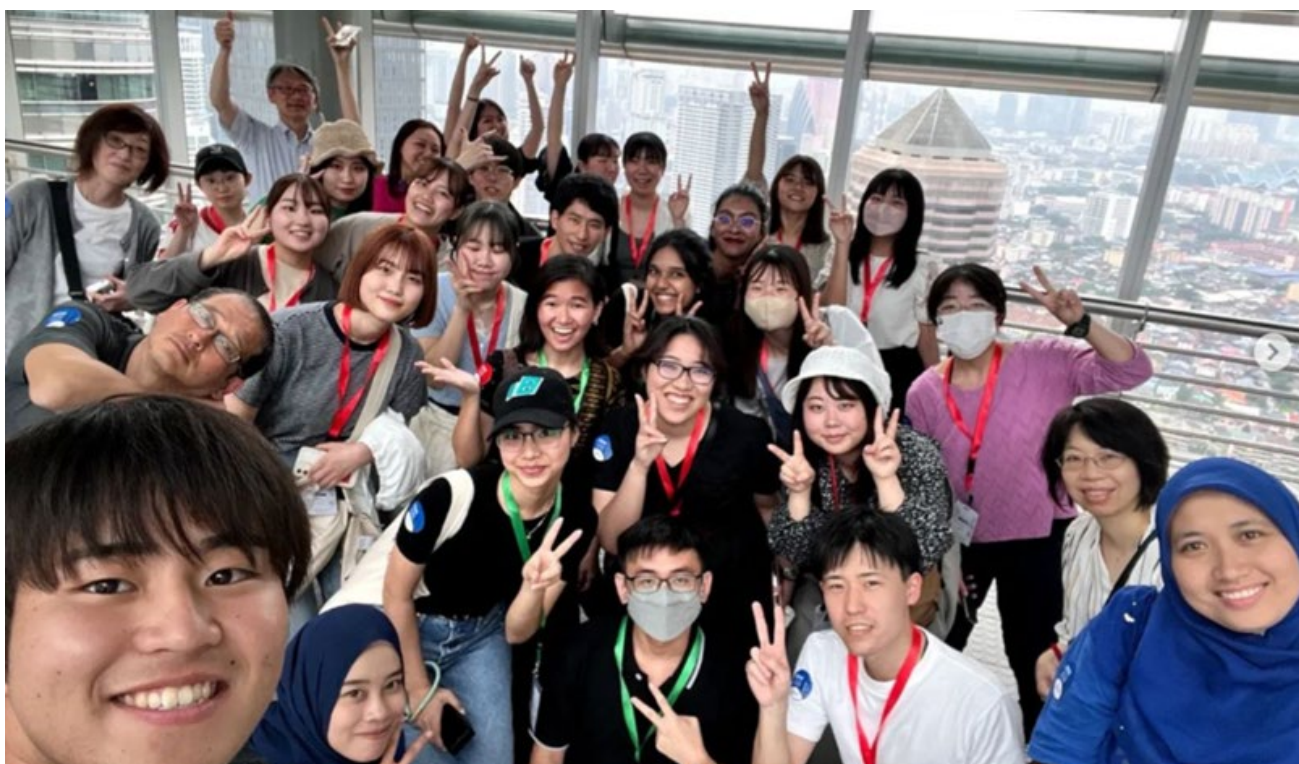
Figure 18: Visiting PETRONAS Twin Tower bridge observation deck

After a few years of being put on hold due to COVID-19, the PUTRA Experience summer program was restarted with the Summer Program with the students from Kagawa University, which ran from 4th - 11th March 2023. The interactive and educational program was held in collaboration between i-PUTRA and the Faculty of Human Ecology. With 20 undergraduate students from various fields, the students explored the beauty of our green and visited the Malay Heritage Museum with our UPM Buddies.