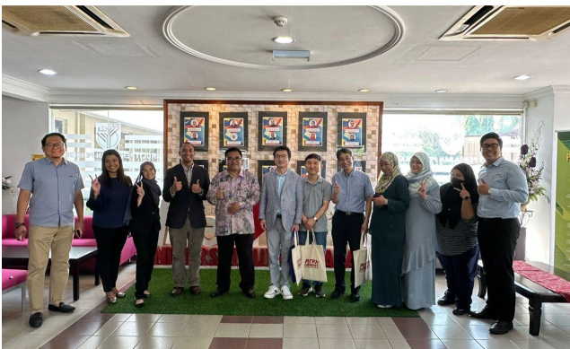
Figure 9: Courtesy Visit from the Delegates from Jeonbuk National University to the Faculty of Educational Studies, coordinated by PUTRA International Centre (i-PUTRA)

The proactive approach of i-PUTRA in coordinating international engagements is a testament to UPM's commitment to fostering global partnerships. By welcoming representatives from a multitude of countries and exploring future collaborations, UPM is positioning itself as a hub for international academic and cultural exchange. With its inclusive approach and ambitious plans for the future, UPM is poised to continue making valuable contributions to the internationalisation of education and research. These efforts not only benefit the university but also pave the way for a brighter, more interconnected future for all.