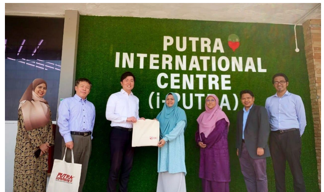
Figure 10: Gift Exchange session between the UPM representative and the Soka University Representatives