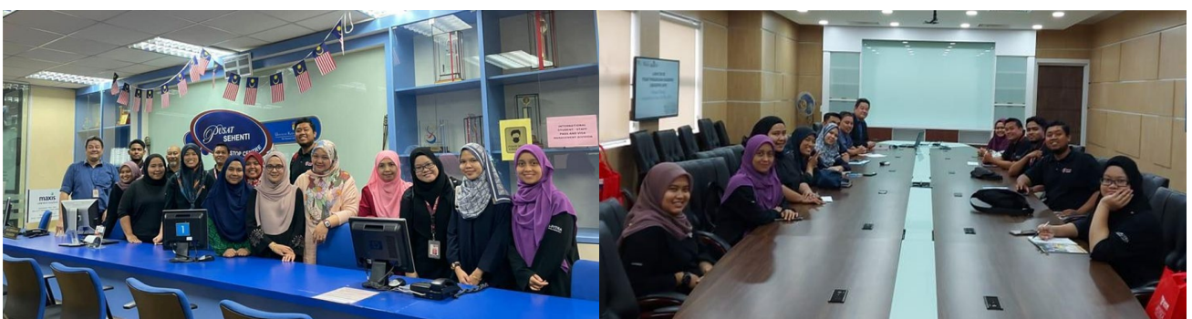
Figure 8: Benchmarking visit to UKM