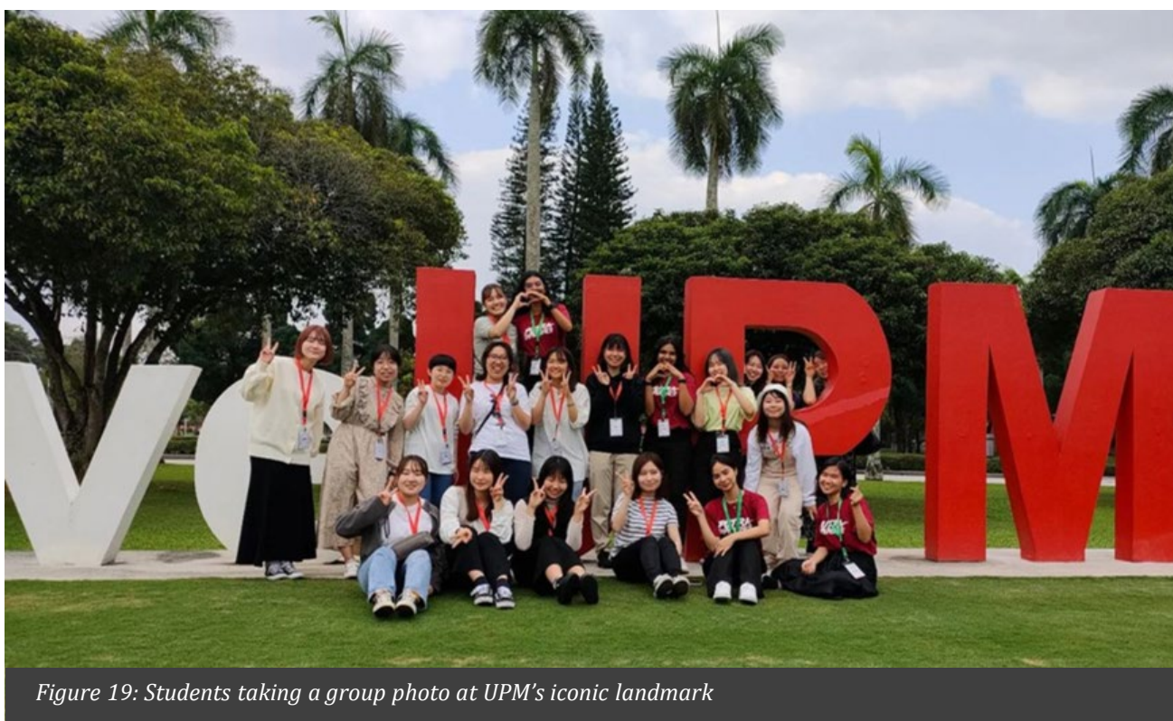
Figure 19: Students taking a group photo at UPM's iconic landmark

“I loved the modules in the program especially at SISFEC because I could learn the difference in vegetation between Japan and Malaysia, I was really happy that the buddies took us to the places we wanted to go and supported us with shopping. I really love the buddies and would love to see them again. Thank you very much for supporting us and making me like Malaysia. I love Malaysia! ”