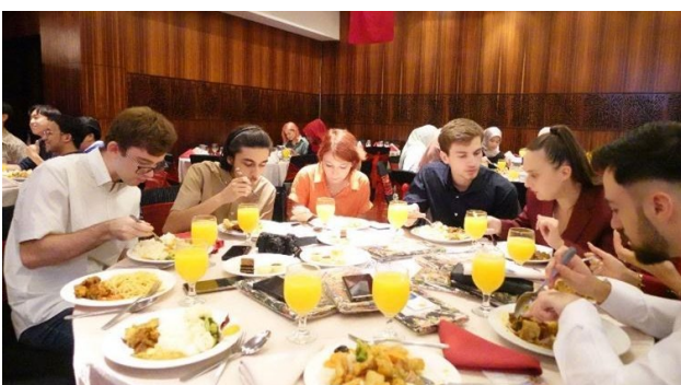
Figure 17: Students enjoyed a Farewell Ceremony Semester 2, 2022/2023, held at Putrajaya

The farewell event held at the picturesque Palm Garden Golf Club, Putrajaya, stood as a testament to the diverse and enriching experiences these students have brought to our campus. Their presence has indeed added cultural vibrancy and fostered a profound understanding of global perspectives among our students and faculty. Students from 11 countries, such as France, South Korea, Germany, Brunei, and Japan, who pursued their inbound mobility program at UPM for the Second Semester of 2022/2023, have undoubtedly provided a rich and multicultural learning experience for everyone involved.