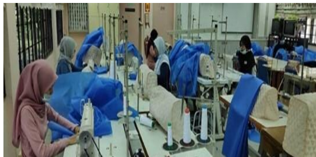
Figure 13: PPE production process

30 APRIL 2020 - In order to fulfill the needs of the University Health Centre in the pursuit of initiating the enforcement to prevent Covid-19 infection, Clothing Technology Laboratory from the Faculty of Educational Studies, UPM has taken the initiative to escalate the production of Personal Protective Equipment (PPE) to reach 100 units per day. Approximately 20 UPM scholars and staff participated in the sewing process. The laboratory is equipped with 32 industrial sewing machines, six edge sewing machines, two button sewing machines, a fabric cutting sewing machine and other sewing instruments.