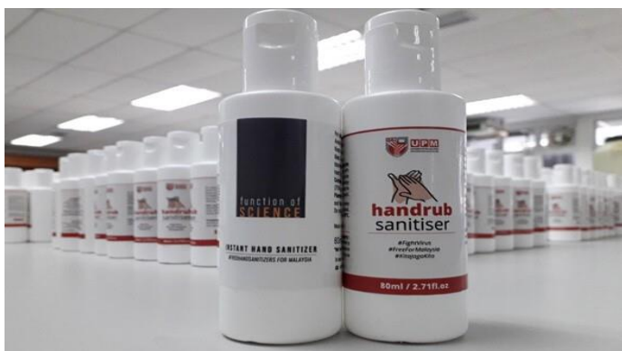
Figure 15: Hand sanitizers produced by Faculty of Science, UPM.

5 MAY 2020 - Universiti Putra Malaysia (UPM) has successfully produced 1,255 liters of hand sanitary fluid in an effort to curb the spread of the COVID-19 outbreak. The UPM hand sanitizers were produced in two phases by the Department of Chemistry, Faculty of Science. The sanitizers were donated free of charge to frontline staff at several institutions and locations. These included University Health Centre, UPM Teaching Hospital, UPM campus essential services, UPM students, B40 residents around Serdang, Putrajaya, Cyberjaya, Kelang, Kuala Lumpur and several red zones of COVID-19 infection.