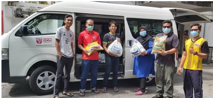
Figure 2: Food packs given to UPM students.

As for UPM students who are staying at home, the University Health Center (PKU) keeps in touch with the respective students to obtain their health status information. The PKU operates from 8am to 5pm on weekdays to provide care to students in need and a day-to-day risk screening counter service. UPM students are reminded not to leave the campus for health and safety purposes in order to prevent Covid-19 infection.