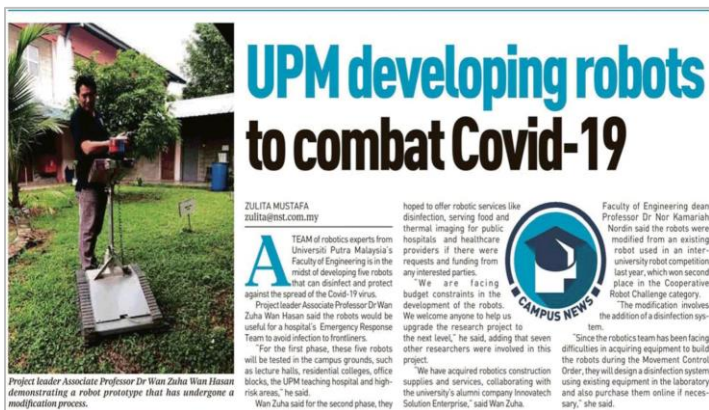
Figure 8: Newspaper cutting on robot development to combat Covid-19

https://www.nst.com.my/education/2020/04/584432/upm-developing-robots-combat-covid-19