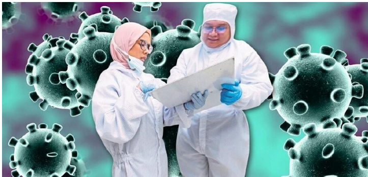
Figure 5: Frontliners involved in laboratory work.

Read more: https://www.nst.com.my/education/2020/04/582522/mala%20ysian-varsities-join-covid-19-testing-battle?%20fbclid=IwAR3tiLvSCmKZfy6xkUA68u9V6cXzoAEY_8i7PQ%20OSdhzqhWlr8v1x9amdij8