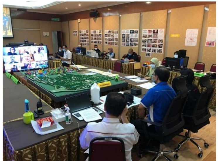
Figure 4: The operational team on duty.

https://www.hmetro.com.my/mutakhir/2020/04/561847/covid-19-upm-tubuh-pasukan-khas