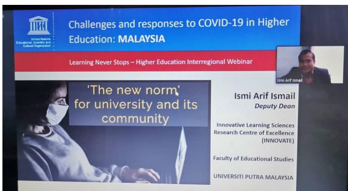
Figure 12: UNESCO collaboration in responding to Covid-19 issues.