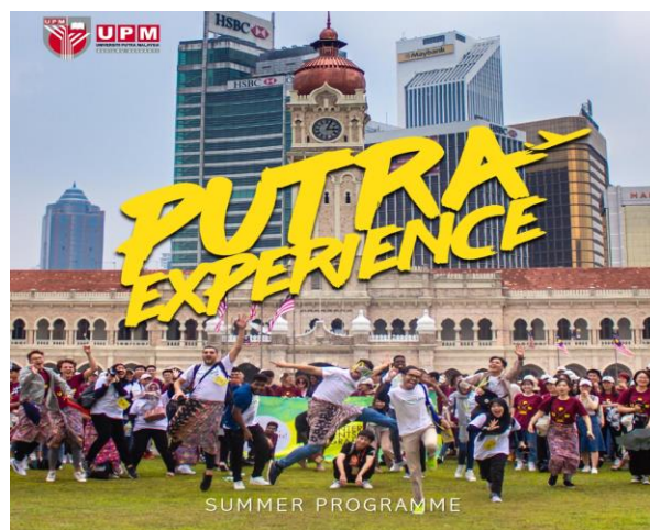
Figure 19: Summer programme as per advertised at i-PUTRA website

Putra Experience is a cluster program where i-PUTRA offers both short term programs such as visits, professional training; and long term program such as internship, research attachment, and semester exchange that can go up to 12 months. Putra Experience allows international students to experience the perfect balance of academic excellence, unique culture, and amazing flora and fauna in Malaysia. For UPM students, Putra Experience provides the opportunity and support for students to experience a new culture and to broaden their horizon together with our partners. Come and join our Putra Experience Summer Programme at: https://intl.upm.edu.my/summer_school-3455