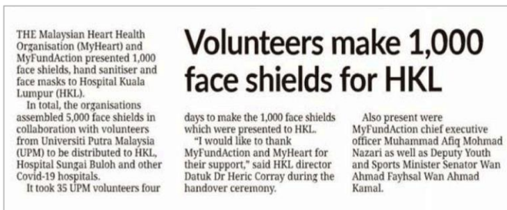
Figure 10: Newspaper cutting on UPM volunteers working on 1000 face shields.

Read more: https://www.thestar.com.my/metro/metro-news/2020/04/23/volunteers-make-1000-face-shields-for-hkl