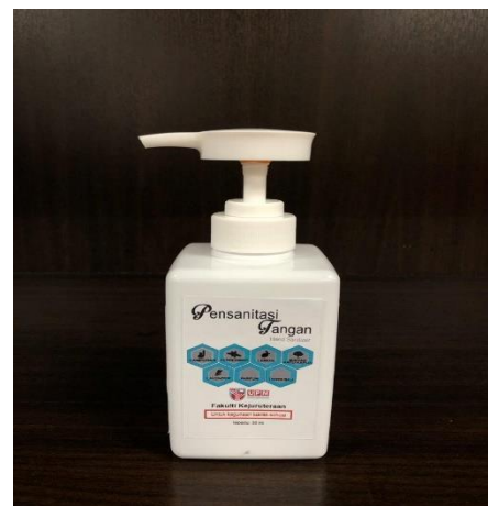
Figure 16: Hand sanitizers produced by Faculty of Engineering, UPM.

Earlier, a group of researchers from the Faculty of Engineering, UPM has taken the initiative to produce more than 700 hand sanitizers using aloe vera gel formulation to prevent the spread of the COVID-19 virus. The sanitizer is for internal use within the campus, especially at the central areas around the Faculty of Engineering, such as at the office counters and elevators, as the first precautionary measure for faculty members.