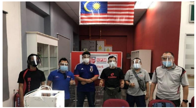
Figure 3: UPM experts and volunteers involved in face shields production.

30 MARCH 2020 - Educational institutions have come together to produce face shields for frontline healthcare workers in battling the Covid-19 outbreak. At Universiti Putra Malaysia (UPM), a team of experts and volunteers produced 5,000 face shields for frontliners at the government hospital near the campus. A total of 30 UPM experts and volunteers led by the 'Putra Makers Space UPM' based at the Faculty of Engineering, collaborated with three UPM labs. The team comprised of 19 members from the Faculty of Engineering, six members from the Longe Medikal Sdn Bhd-Putra Science Park and five from the Faculty of Design and Architecture.