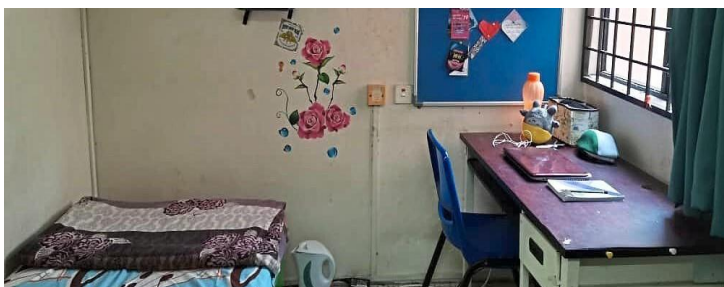
Figure 11: One of the students' room in their hostel.