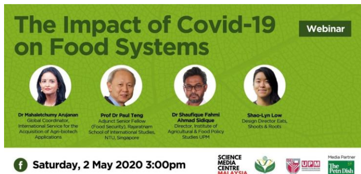
Figure 14: Poster on the topic publicized.