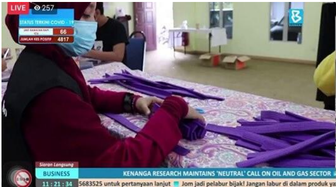
Figure 6: Face shields production process.

Read more: https://www.youtube.com/watch?v=PmRseb9BXGw