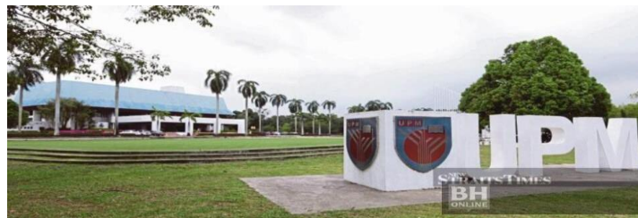
Figure 9: UPM surroundings during MCO.

https://www.bharian.com.my/berita/wilayah/2020/04/677813/pkp-upm-wujud-pusat-panggilan-kecemasan-untuk-hadapi-krisis