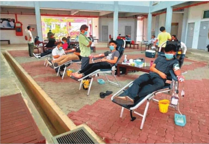
Blood bank personnel monitor the donors during the donation drive at UPM Bintulu Campus.

15 APRIL 2020 - UPM Bintulu runs blood donation drive to help replenish blood bank at hospital - The Borneo Post