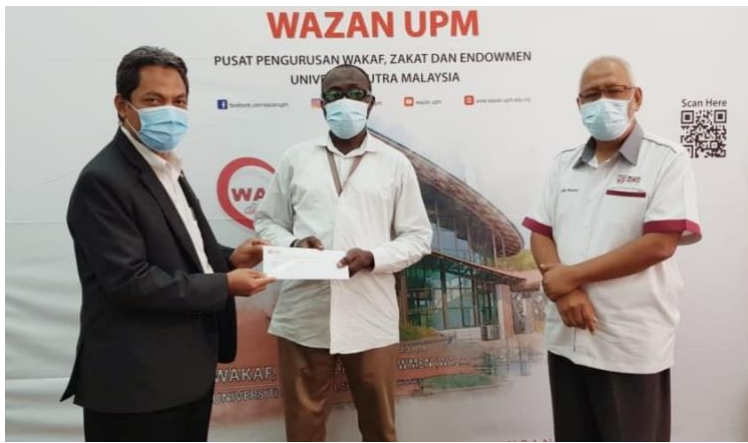
Figure 4: The Centre for Management of Waqf, Zakat and Endowment (WAZAN), i-PUTRA Director has been invited to hand over a small donation for our international student