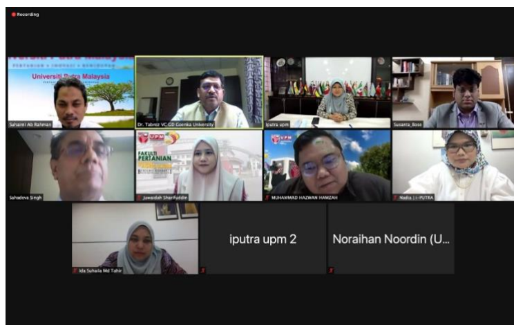
Figure 3: The meeting discussing inbound student mobility focusing on internships up to one year from GD Goenka to UPM in the field of agriculture and engineering.