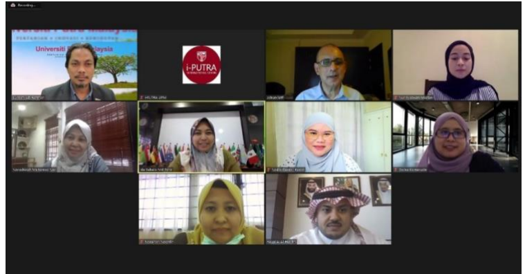
Figure 14: The meeting members between i-PUTRA, SPE and IAU