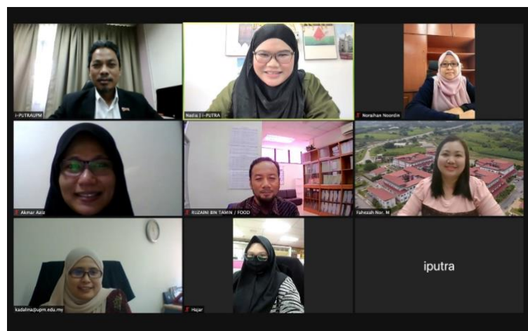
Figure 2: Online discussion between i-PUTRA and UPM AIMS faculty members that were also a mobility coordinator.

i-PUTRA shared insights on optimising AIMS scholarships allocation for 34 future receivers to undergo an outbound mobility programme to 9 Asian countries in September 2021. The meeting also discussed the possibility of the AIMS virtual exchange programme and plans for a dedicated webinar to boost awareness about the scholarship opportunity among local undergraduate students.