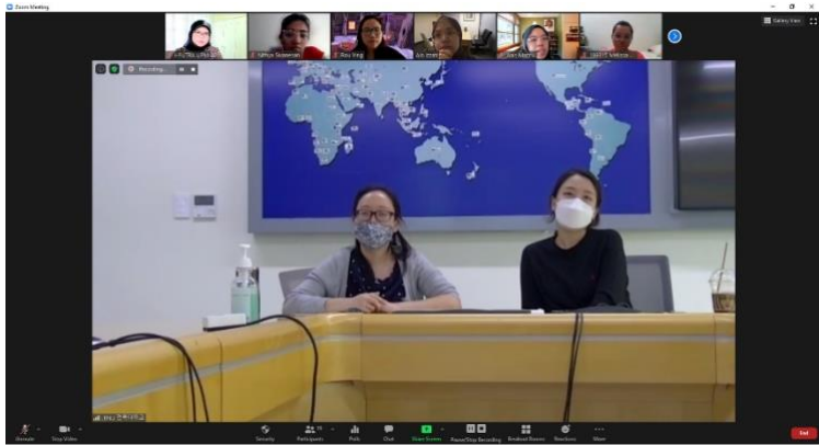
Figure 13: UPM shall be sending 17 students to JBNU in the Fall Semester 2021