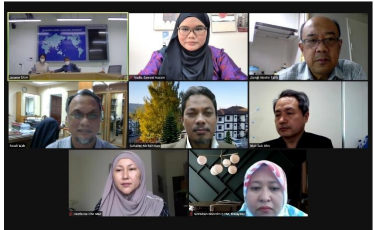
Figure 1: Meeting members between Jeonbuk National University and Universiti Putra Malaysia.

The partnership between JBNU and UPM begins in 2019. Since then, many activities had been initiated such as inbound and outbound mobility programmes. We plan to further boost-up the promotional strategy as to encourage more students to take up this amazing opportunity.