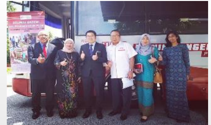
PUTRA® OUTREACH CLINIC