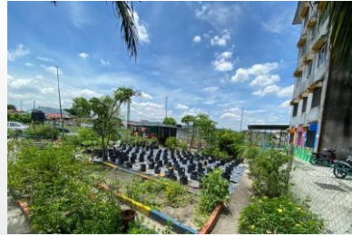
KEBUN KOMUNITI FLAT IKAN