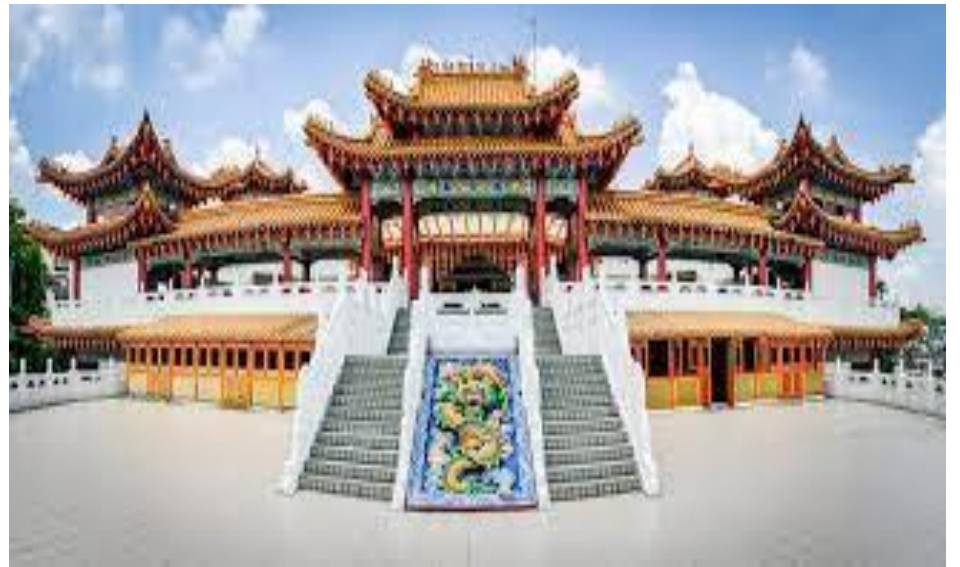
Image :Chinese house of worship Temple or Tokong