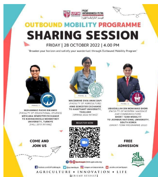
Image: The promotional poster for the sharing session.