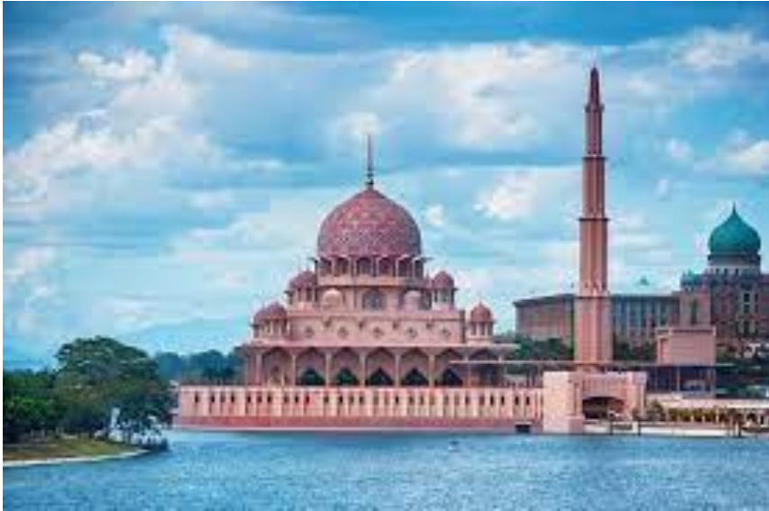
Image :Islamic house of worship Mosque/ Masjid