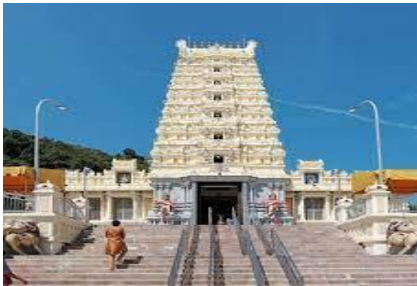
Image :Indian house of worship Kuil Hindu or Mandir