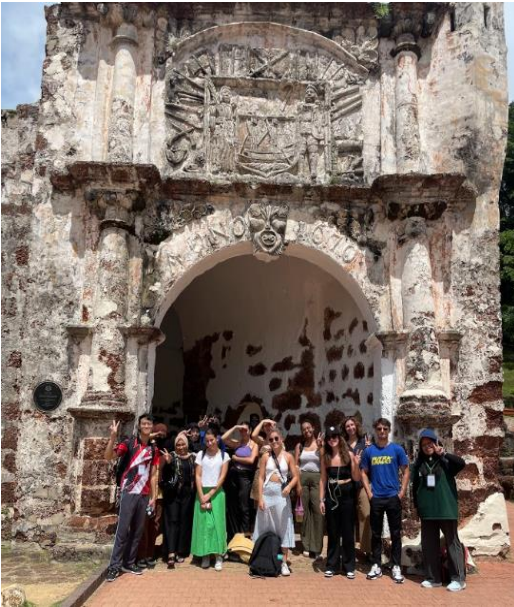
Image: Melaka Trip

Buddies Association UPM held the first physical programme of the year where we took a trip to the historical city of Melaka on 15 October 2022. This trip was successfully joined by 152 committees and participants from many different countries, mainly China, Germany, Austria, France, South Korea, and Indonesia. Our second programme of the year was Buddies Induction, where we welcomed new students into the club. This term, we managed to gather 128 new students into our club through two induction programmes held physically on 28 October 2022 and virtually on 31 October 2022 through the Zoom application.