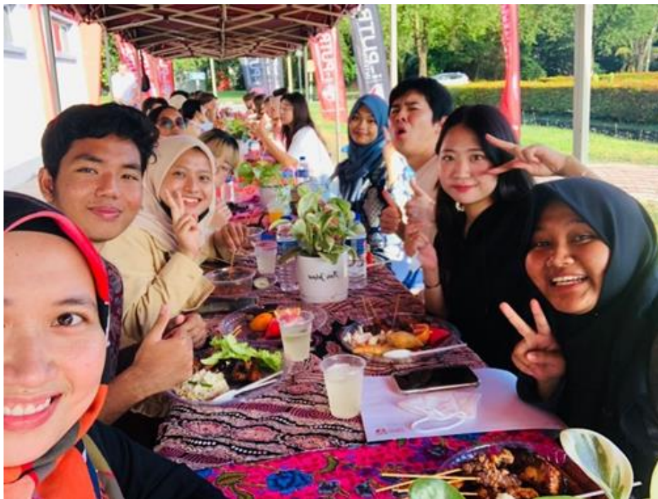
Image: Inbound Semester Exchange student's semester 2 (2021/2022) at the i-PUTRA student farewell party.

As 2022 closed its curtain, i-PUTRA too has put an effort into collaborating with our strategic partners, such as partner universities, the Ministry of Higher Education, agents, international associations, and embassies, offering all-year financial incentives to students, and UPM offices, and taking part in international education exhibitions. These engagements are to make sure that UPM holds its place progressively in becoming a university of international repute. May 2023 opens up more opportunities for UPM and allows us to expand mobility programmes for students.