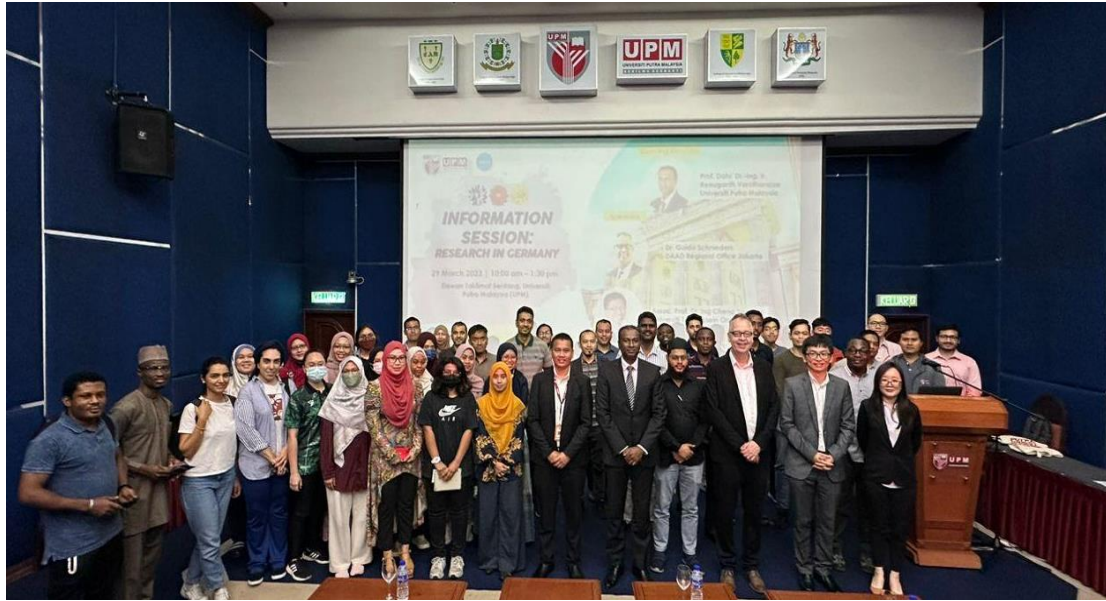
Image: Group photograph with the panels and participants who joined the “Information Session: Research in Germany” seminar.