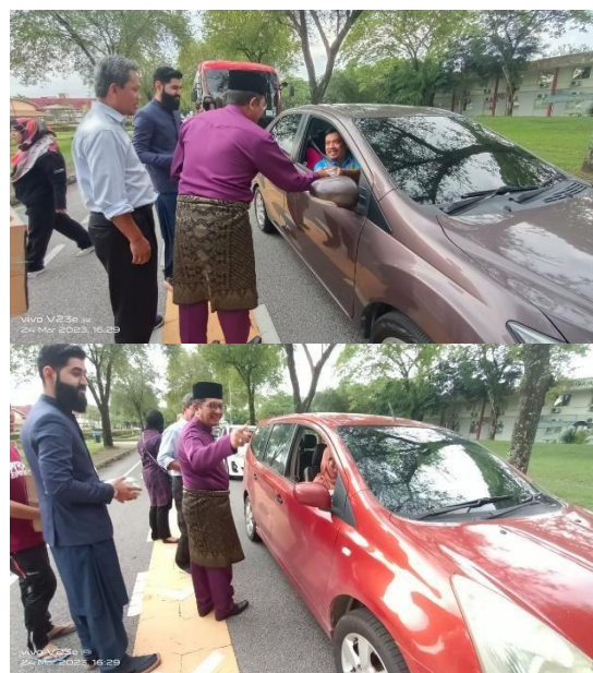
Image: The Vice-Chancellor distributing onde-onde together with international students