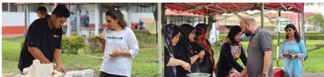
Image: Onde-onde distribution to the international students