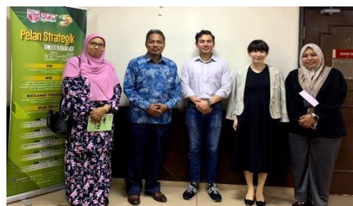
Image: Courtesy Visit from Kokugakuin University, Japan

The combined impact of the resumption of international travel and the effective use of teleconferencing has indeed marked a promising start for UPM's internationalisation efforts in 2023. These endeavours exemplify UPM's commitment to embracing a diverse and interconnected academic community that promotes knowledge exchange, innovation, and cultural understanding. UPM will continue to forge ahead through the expansion of its global partnerships. Thus, strengthening its position as a leading institution in the international academic landscape.