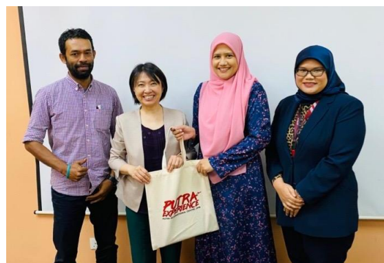
Visit from Tokyo University of Agriculture and Technology, Japan