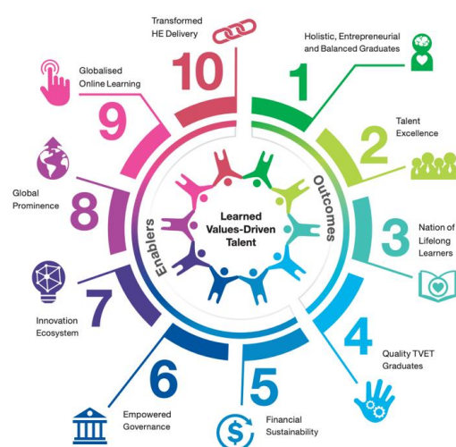
Image: Malaysia Education Blueprint 2015–2025 (Ministry of Higher Education)

In 2013, the Ministry thus began developing the Malaysia Education Blueprint 2015–2025 (Higher Education) or the MEB (HE). The MEB (HE) introduced 10 Shifts that spur continued excellence in the higher education system. All 10 Shifts address key performance issues in the system, particularly with regard to quality and efficiency, as well as global trends that are disrupting the higher education landscape. One of the shifts is number 8. Global Prominence.